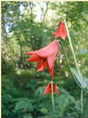
Photo of Grey's Lily

In 1990, 87% of Avery County was forestland, but this number is quickly diminishing as second-home development encroaches upon this biologically significant landscape. High Country Conservancy and the Trust for Public Land are working to protect these critical waters and habitats.